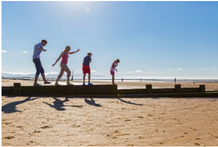
the jewel in Rhyl's crown: the beach is popular but not easy to reach on foot or by bike from the town centre

Rhyl is one of North Wales' most famous seaside towns and one of the few towns in Denbighshire to benefit from a number of streets already being pedestrianised, which is