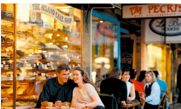
The 'new normal' for pubs, restaurants and cafes in Llangollen?

Comments received both directly to the council and circulated locally on social media groups have highlighted comments from within the Llangollen community that the existing parking bays cause traffic flow issues as pedestrians and cyclists are forced around the cars and into the road at peak times. We would like to take this opportunity to see if the social distancing measures can actually improve traffic, cyclist and pedestrian flows through the town centre.