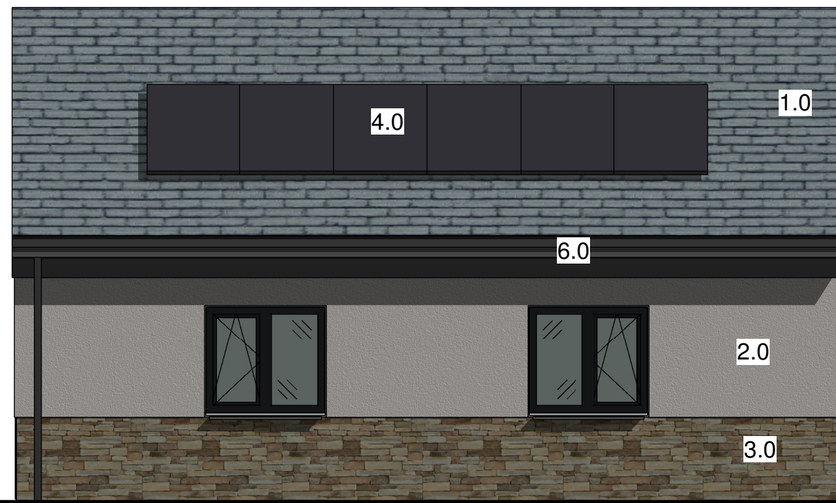
5 Front 1 : 50