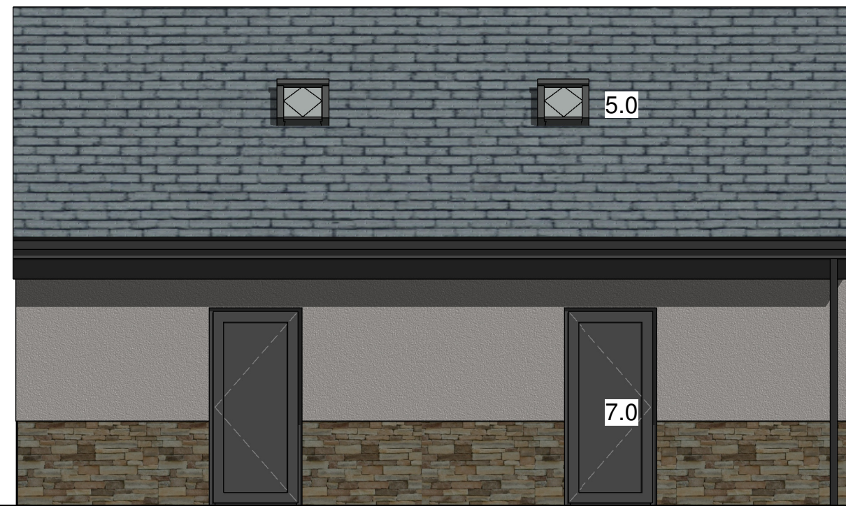
2 Rear 1 : 50