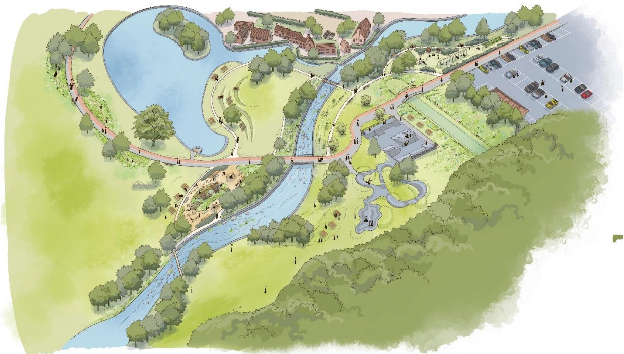
Figure 5 - artist's impression of an aerial view of Cae Ddol Park with the proposed short-term improvements