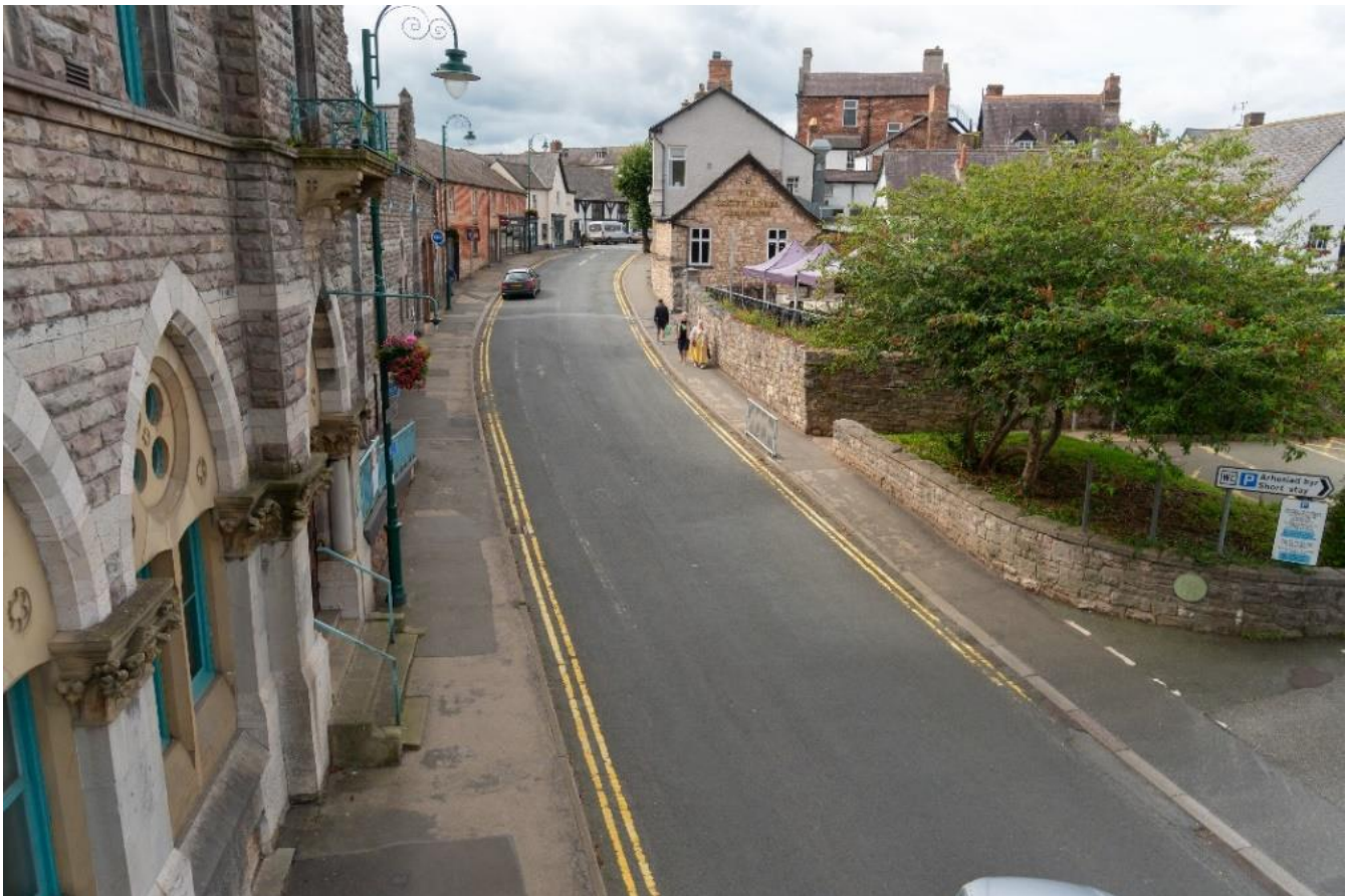
Figure 3 – image showing the current layout of Market Street between St Peter's Square and the entrance to Market Street car park

Two-way traffic would be retained for all road users (vehicles and cyclists) on the rest of Market Street. (From the entrance to Market Street car park to the Brier roundabout (near Tesco/the Craft Centre). This would also allow traffic to still access Market Street car park, to and from, the Brier roundabout.