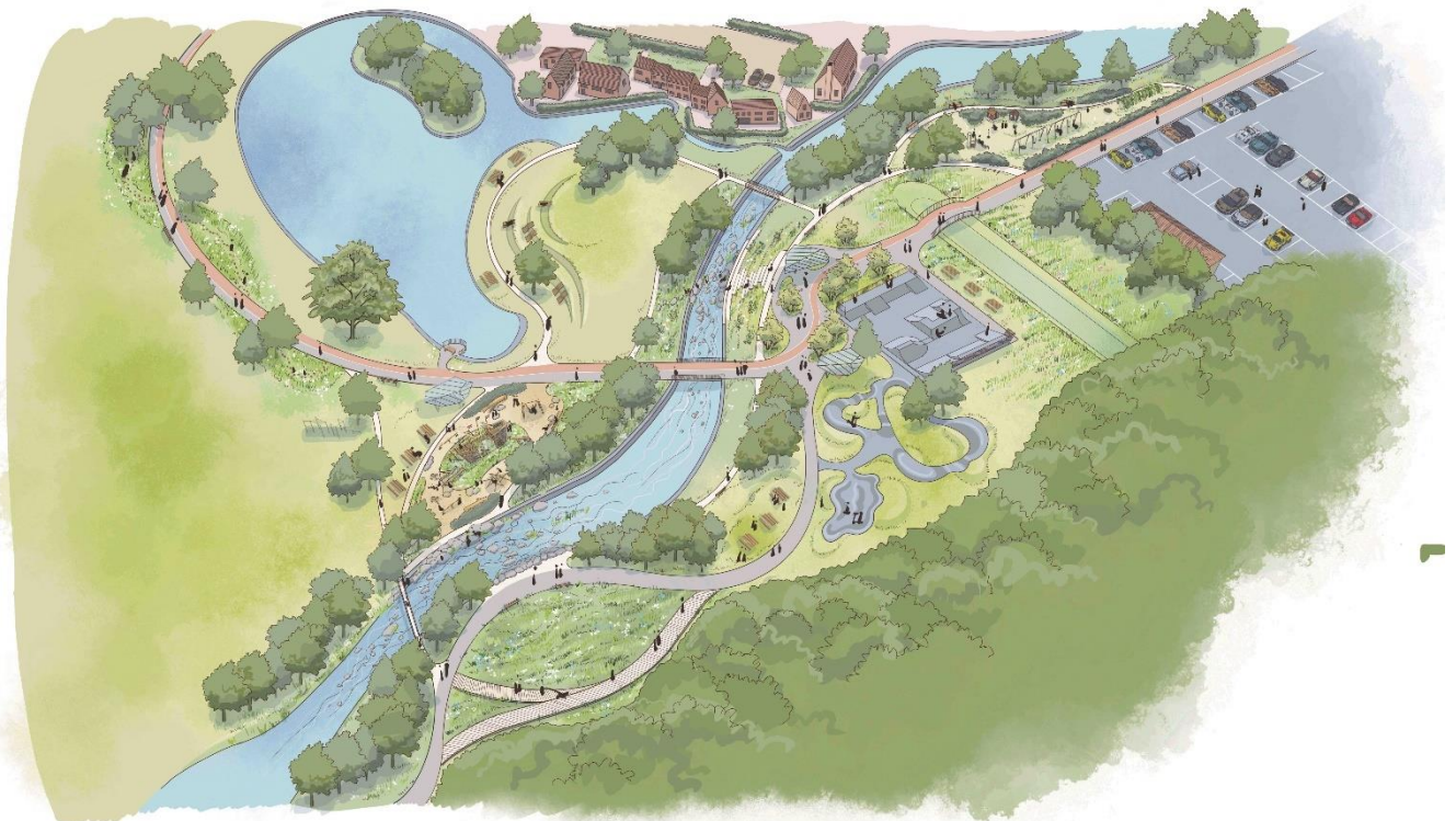
Figure 6 - artist impression of Cae Ddol Park as viewed from above, with additional structures and features in place

You can view an artist's impression of the longer-term vision for Cae Ddol in the image below: