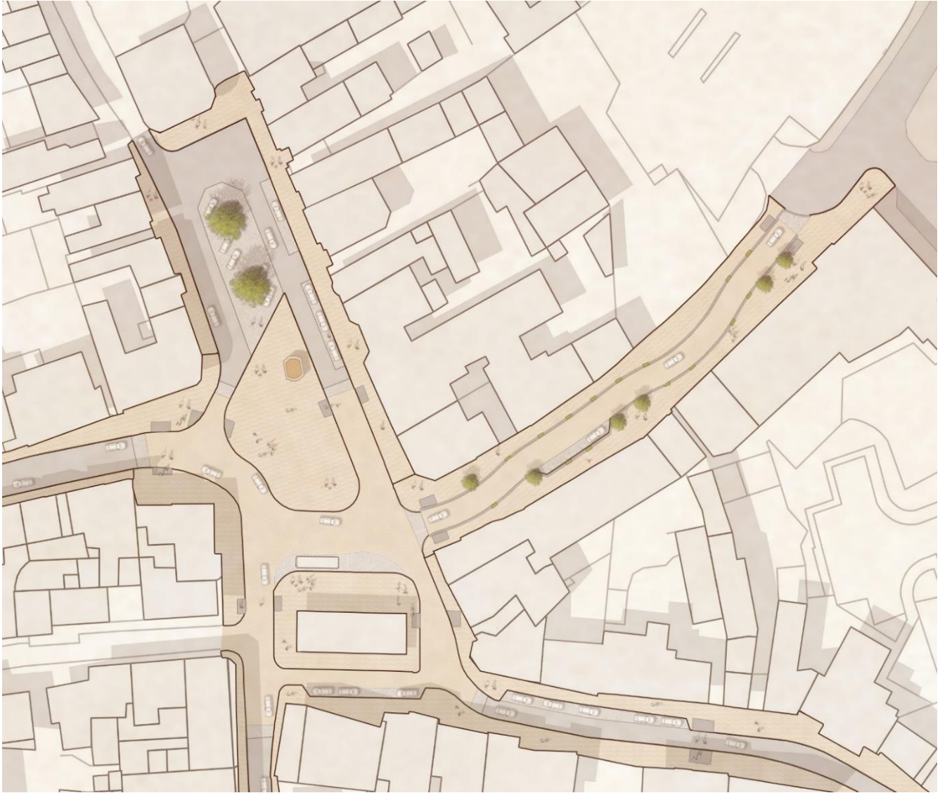
Figure 5 - map showing Option 1 of proposed layout to Market Street as viewed from above