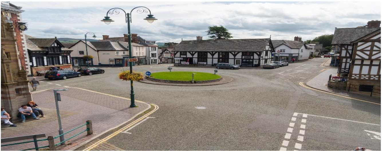
Figure 1 - image of the current layout of St Peter's Square

Some artist impressions of before/after of St Peter's Square can be viewed below