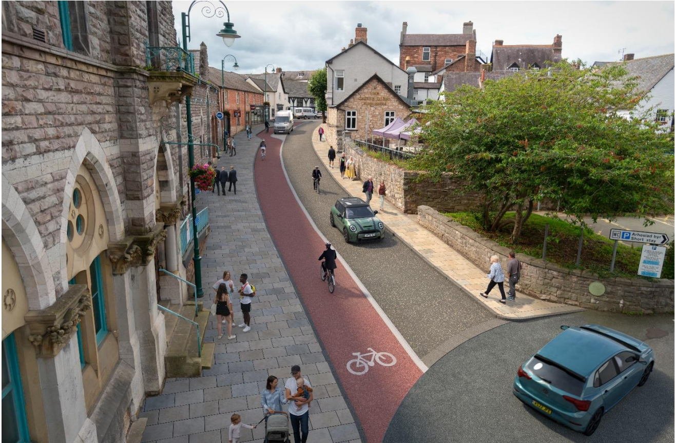
Figure 6 - 3D (CGI) visualisation of Option 2 of proposed layout for Market Street

This option shows vehicular traffic (cars, motorcycles, vans, lorries, buses etc) travelling one way DOWN Market Street, from St Peter's Square to the entrance to Market Street car park.