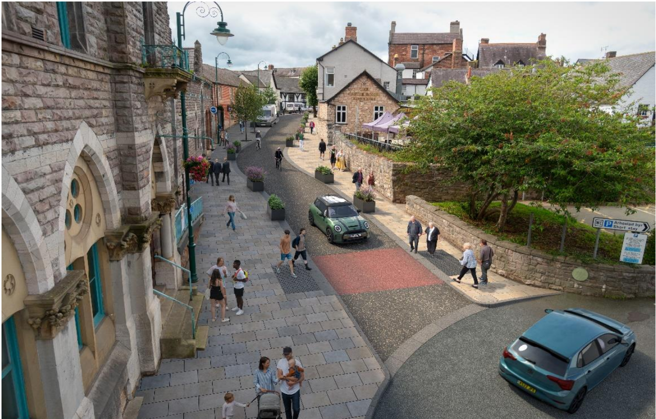
Figure 4 - 3D (CGI) visualisation of Option 1 of proposed layout for Market Street

This option shows an arrangement known as an “Informal Street”. Under this arrangement, vehicular traffic (cars, motorcycles, vans, lorries, buses etc) would travel one way DOWN Market Street, from St Peter’s Square to the entrance to Market Street car park. Cycling would, however, be permitted in both directions i.e. cyclists would be able to travel both up and down this section, all motor vehicles (including motorcycles) will only be permitted to travel down the hill.