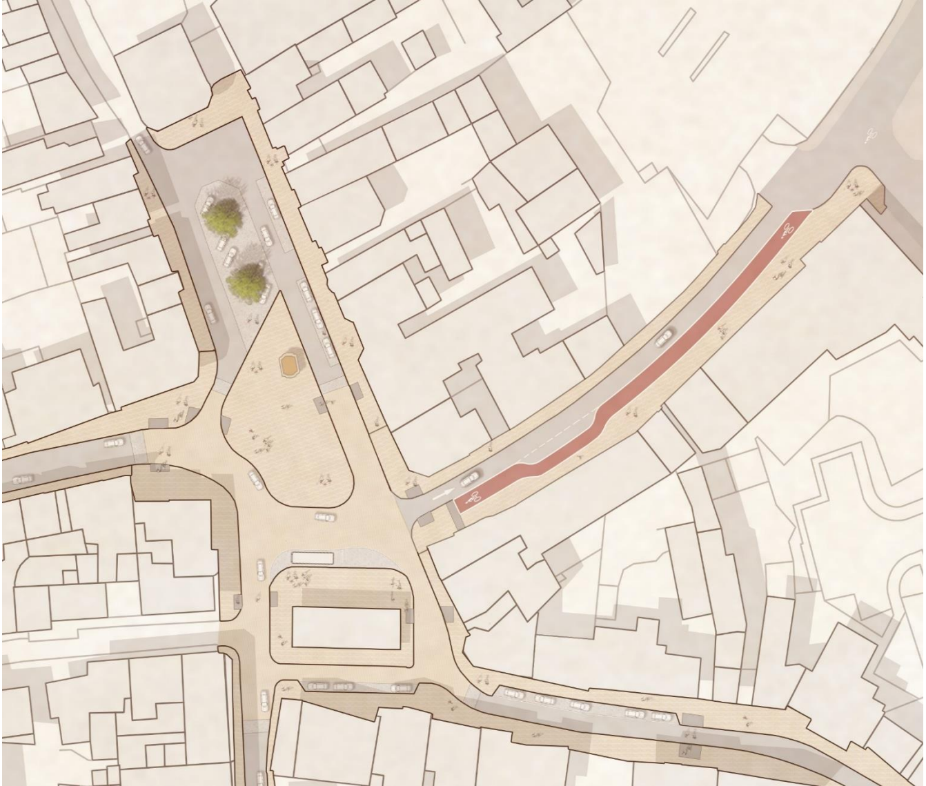
Figure 7 - map showing proposed Option 2 layout changes to Market Street, as viewed from above