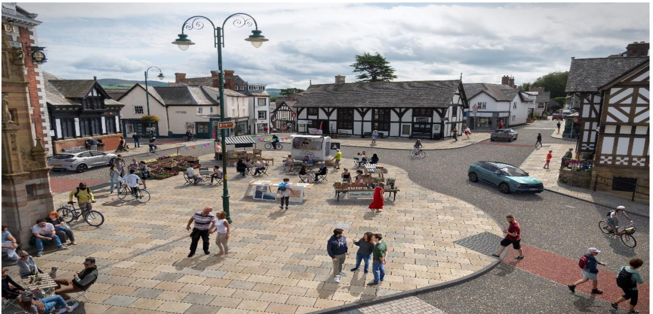
Figure 2 - 3D (CGI) visualisation of the proposed layout for St Peter's Square