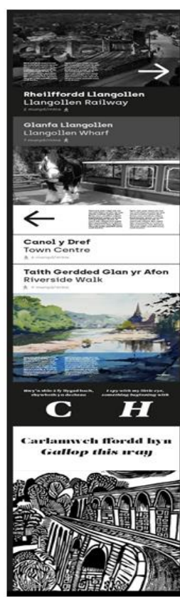
C. Black and white – Using bold black and white with grey tones