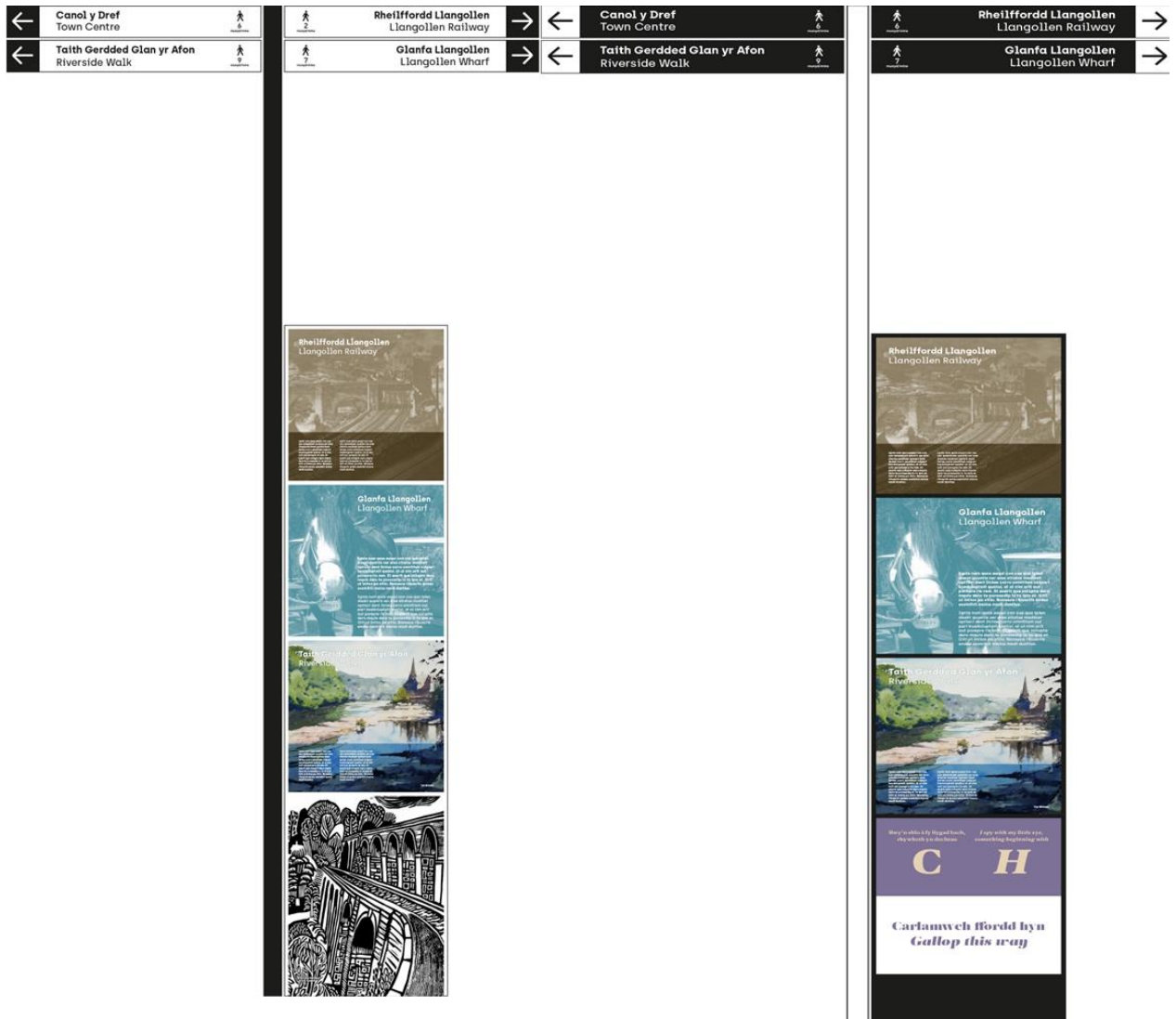
A. White fingerpost with black lettering

This design shows the fingerposts to help people find their way with the history of the area attached to the bottom of the post*.