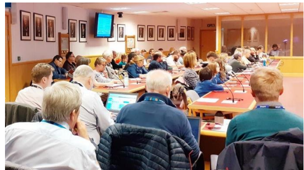
Public meeting held 25 th February pictured; 60 people attended in person & 104 watched live online

The intention is to consult with the public on the Council's draft Climate and Ecological Change Strategy and Action Plan in November and seek approval and adoption at Cabinet and Full Council in January.