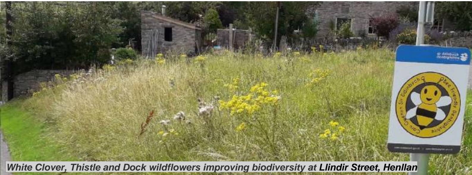
White Clover, Thistle and Dock wildflowers improving biodiversity at Llindir Street, Henllan

Welcome to the first instalment of the Climate and Ecological Change Newsletter for Members which will be sent out every 6 months to update on the Council's actions to respond to the climate change and ecological emergency.