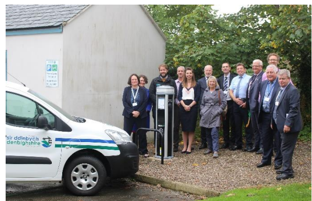
Working Group Members pictured October 2019

supported by officers. The Working Group is an advisory, non-decision making body but may make recommendations or requests to other Denbighshire County Council committees, panels, lead members or officers as appropriate. The Working Group will disband once the plan for the authority to become net carbon zero and enhance biodiversity by 2030 has been agreed or adopted by Council.