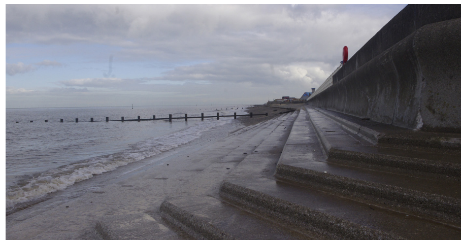
Typical examples of existing step revetment and seawall at Rhyl