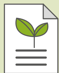
Ecological considerations built into land strategies and policies