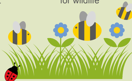
Leave grass to grow during the summer for wildlife