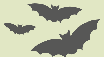
Replace outdoor lights to protect bats, birds and insects