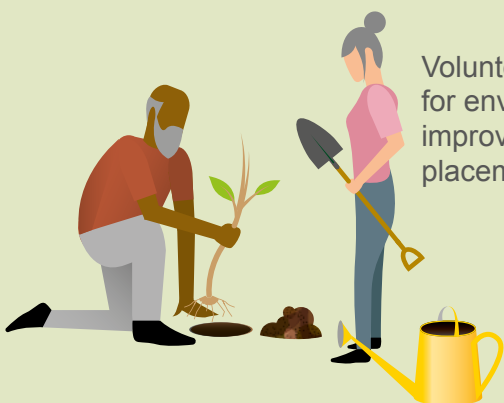
Volunteer opportunities for environmental improvement placements