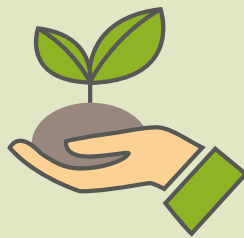
Manage and restore land