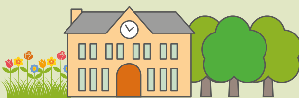
Plant trees and wild flowers within school grounds and around car parks