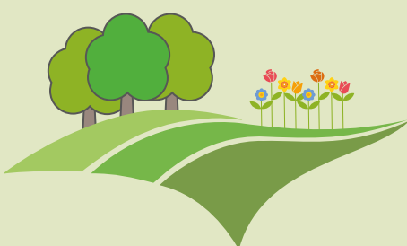
Make the best use of land the Council owns across the County