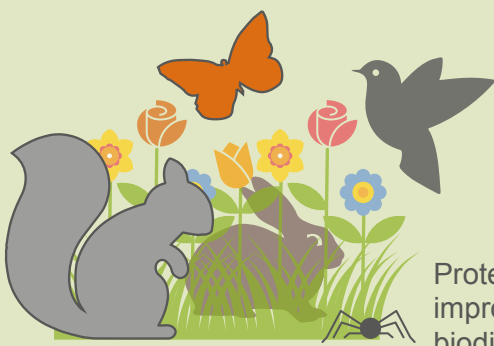
Protect and improve biodiversity

We aim to deliver a positive impact for ecology from all of our activities: