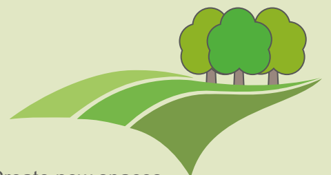
Create new spaces for nature

We will increase species diversity across our Council owned and operated land